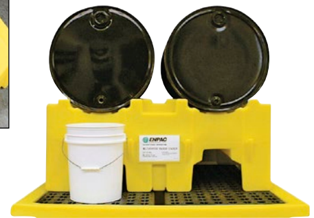
Drums, pail & pallet not included