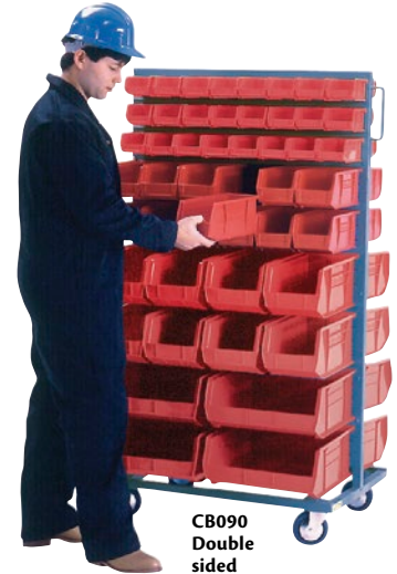
CB090 Double sided