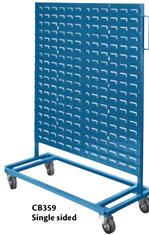
CB359 Single sided